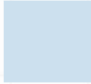
Interior fittings: Shelf, lockable compartment (lower, upper or central).